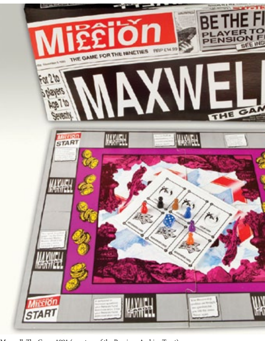
Maxwell: The Game 1991

Which is your personal favourite piece in the PAT, or which you are most proud to have obtained?